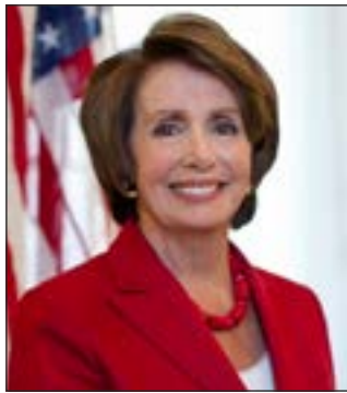
Nancy Pelosi (D—California) is the current Speaker of the House.