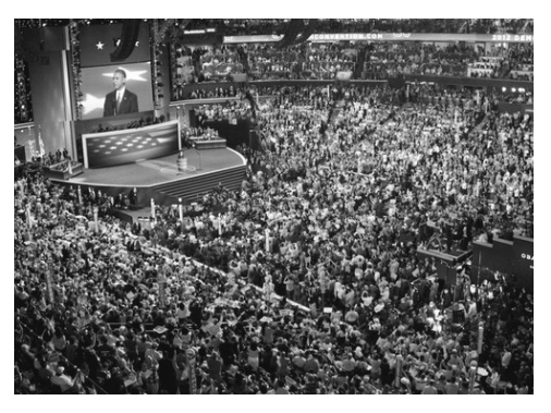
Barack Obama speaks at the Democratic National Convention in 2012.