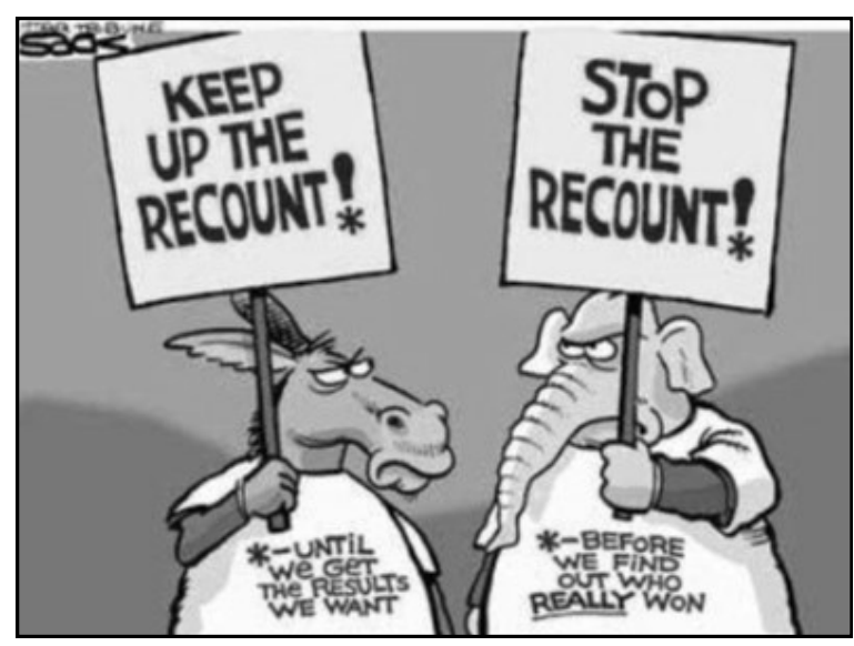
Cartoon by Steve Sack, The Minneapolis Star-Tribune

2. What is the Republican message? (Look at the sign and t-shirt.)