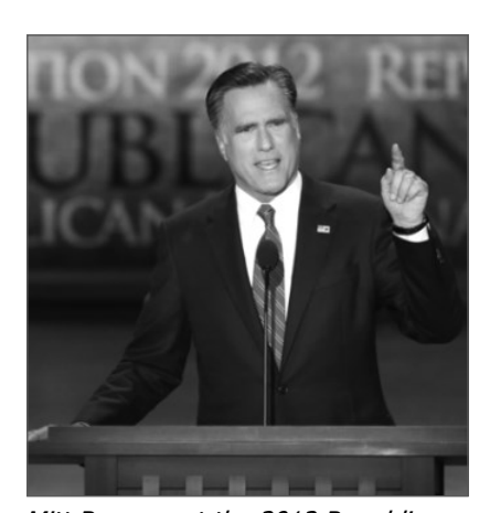
Mitt Romney at the 2012 Republican National Convention

The presidential and vice presidential nominees each make an acceptance speech that is meant to bring the party together to support the nominees and forget about the months of debate and arguments that led up to their nomination. This is the first major step in getting the national campaign for president up and running.